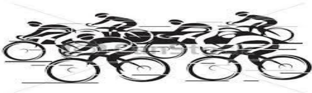
© Can Stock Photo - csp18945239